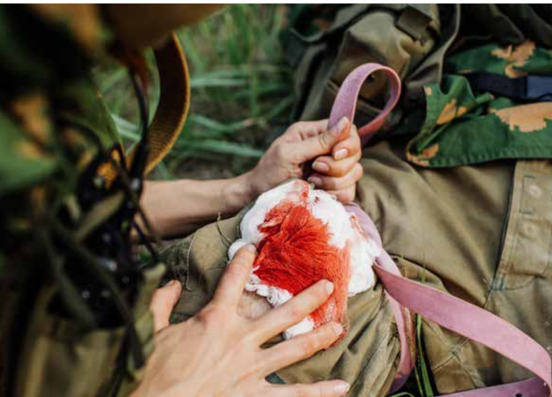
Figure 1: The trauma triad of death is a medical term that describes the combination of hypothermia, acidosis and coagulopathy. Severe bleeding during trauma reduces the delivery of oxygen and can lead to hypothermia. This can prevent blood from clotting, increasing blood loss.