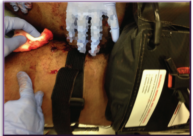
Figure 2 The AAJT is applied to the left groin. The CAT has been left in place but loosened. The wound is seen just to the left of the CAT.

transferred from the emergency department to the Level I trauma center via Advanced Life Support (ALS) ambulance with a nurse (Figure 3). Throughout transport and movement to the trauma unit, the AAJT remained inflated, and no blood loss was noted from the proximal left leg wound.