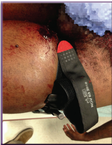
Figure 1 Initial use of the CAT in the emergency department. The proximal femoral wound is seen with initial hemostasis noted.

The AAJT was applied by the primary emergency physician around the hips, with the bladder against the left groin (Figure 2). The belt was tightened, the windlass then was tightened and secured, and the bladder was inflated until the manometer showed green, indicating 250mmHg pressure. The CAT was kept in place, but the tension was released. The wounds were reassessed, and no blood loss was found to have occurred. The patient commented that the AAJT was more comfortable than the CAT.