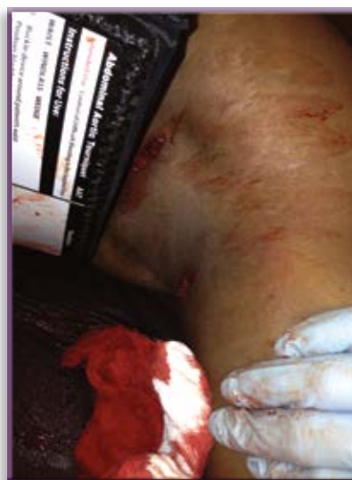
Figure 3 Two axillary wounds were spurting pulsatile blood until the AAT was applied. At the bottom, the right hand is assessing the distal pulse in the brachial artery.

airway. The first unit of PRBCs was started as the RSI medications were given.