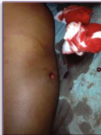
Figure 1 The entrance wound is in the upper left arm over the proximal portion of the triceps muscle belly and distal to the margin of the deltoid muscle.

The diaphoretic patient was completely unresponsive. The primary emergency physician focused on hemorrhage control, and a partner focused on securing the airway, which was initially done with bag-valve-mask ventilation. Monitoring at that time showed a heart